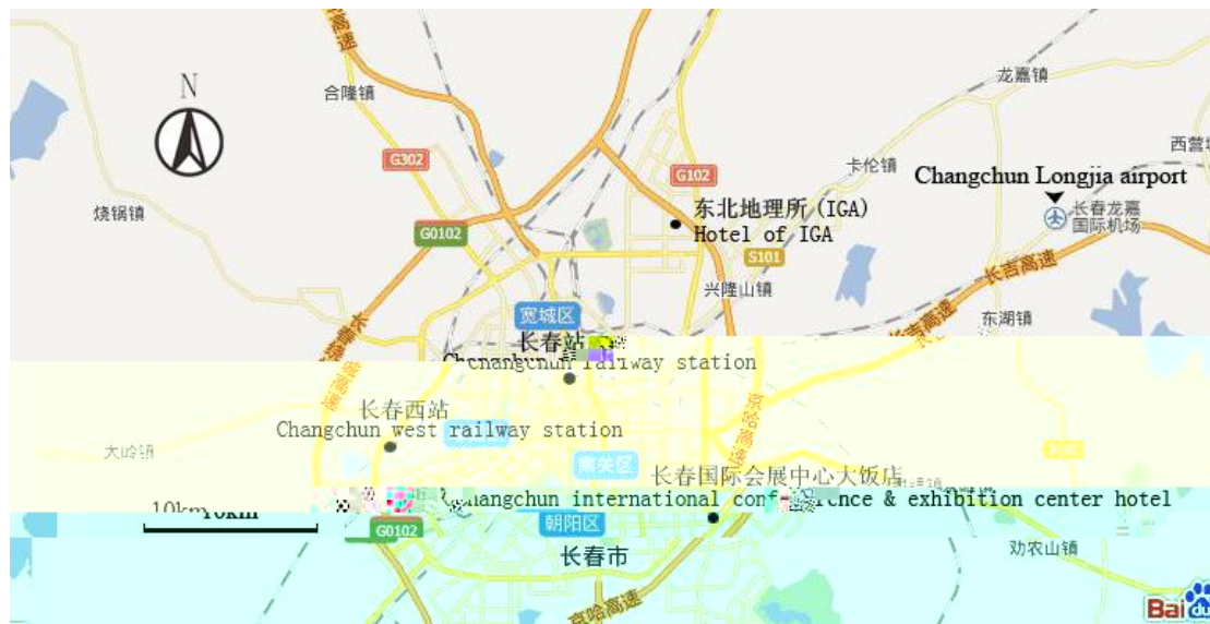
Fig.1 Locations of the airport, railway stations and the hotels

The transportation during the conference between the hotel and the conference (if applicable) will be arranged by the organizing committee.