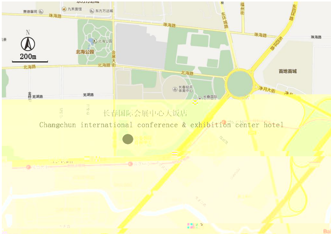
Fig.3 Location of the Changchun international conference & exhibition center hotel